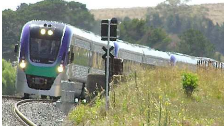
Left: The 0938 Southern Cross - Ararat service rounding the corner and arriving into Ballan.

Arrival of the 1042 into Ballan, was two minutes down at 1044 - however, I was just glad to be one of the only people to be on the first V'Locity revenue service!!!!