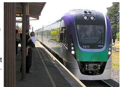
Right: The 0938 Southern Cross - Ararat service arriving into the platform at Ballan.