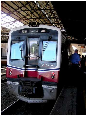
7010 after arrival into Ballarat.