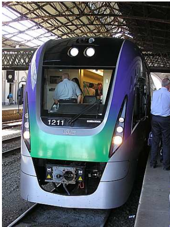
1211, part of Unit VL11 upon arrival into Ballarat.

Consist: V'Locity Units 11 (1211+1111), 23 (1223+1123) & 18 (1218+1118)